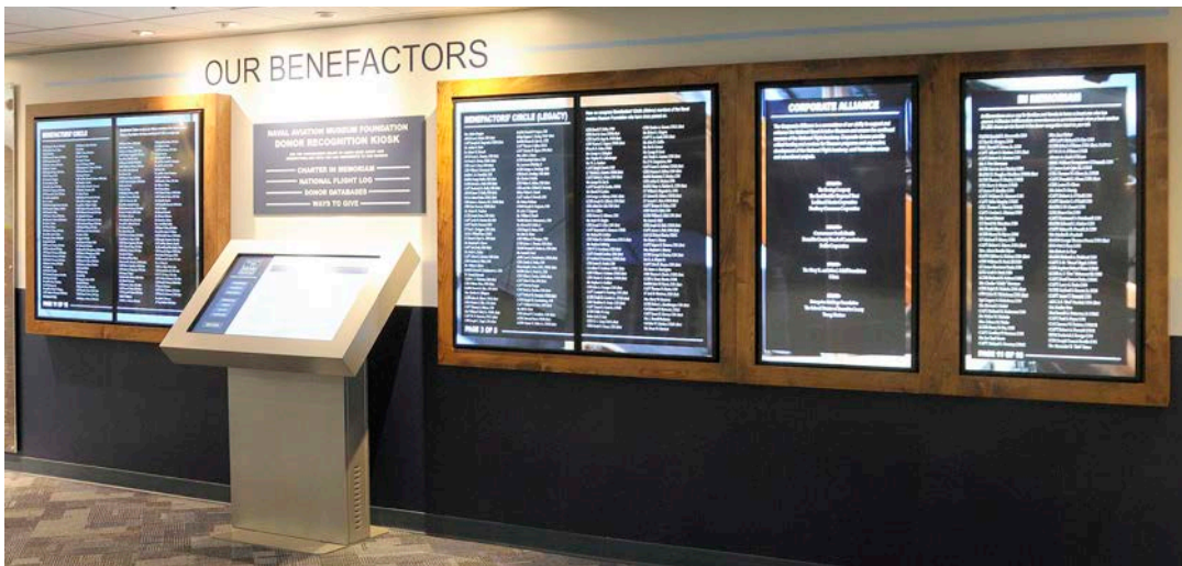
Donor recognition video wall graces museum's main entrance

As part of a renovation of the museum's donor recognition space, the museum's management team decided to convert a significant portion of their traditional donor recognition plaques to a digital format. Physical space was short which was making it difficult to continue adding donation plaques. Beyond that a digital approach would make future corrections and additions simpler and less costly.