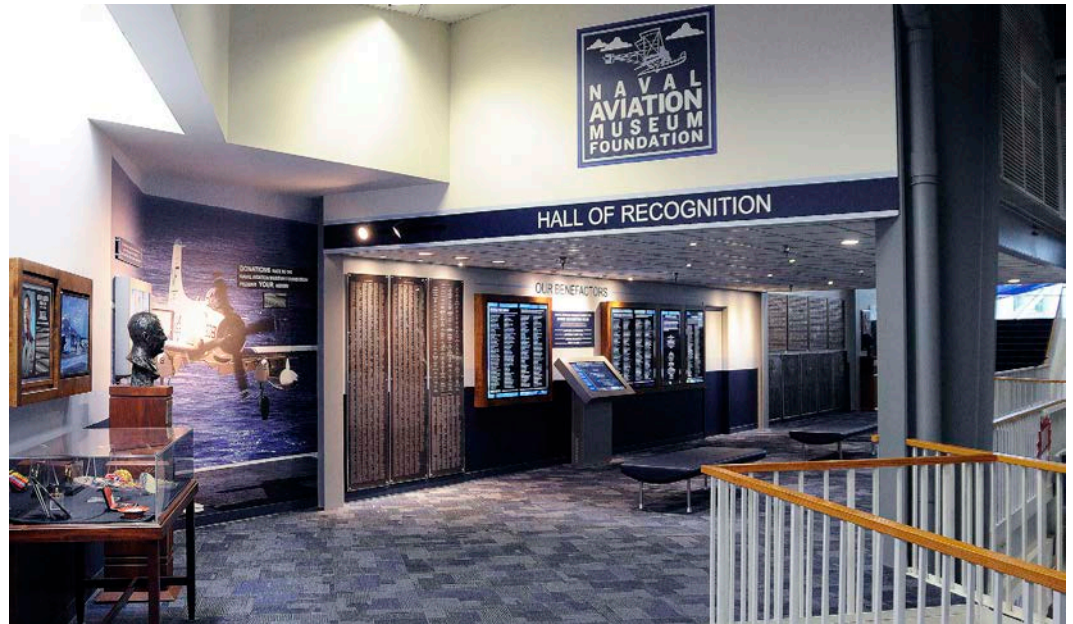
Donor recognition video wall graces museum’s main entrance

Userful Corporation is a leading centralized display software company that makes it simple and affordable for organizations to implement and centrally manage video walls, virtual desktops and beyond with exceptional performance. Userful is the trusted provider of over 1 million centralized displays in over 100 countries.