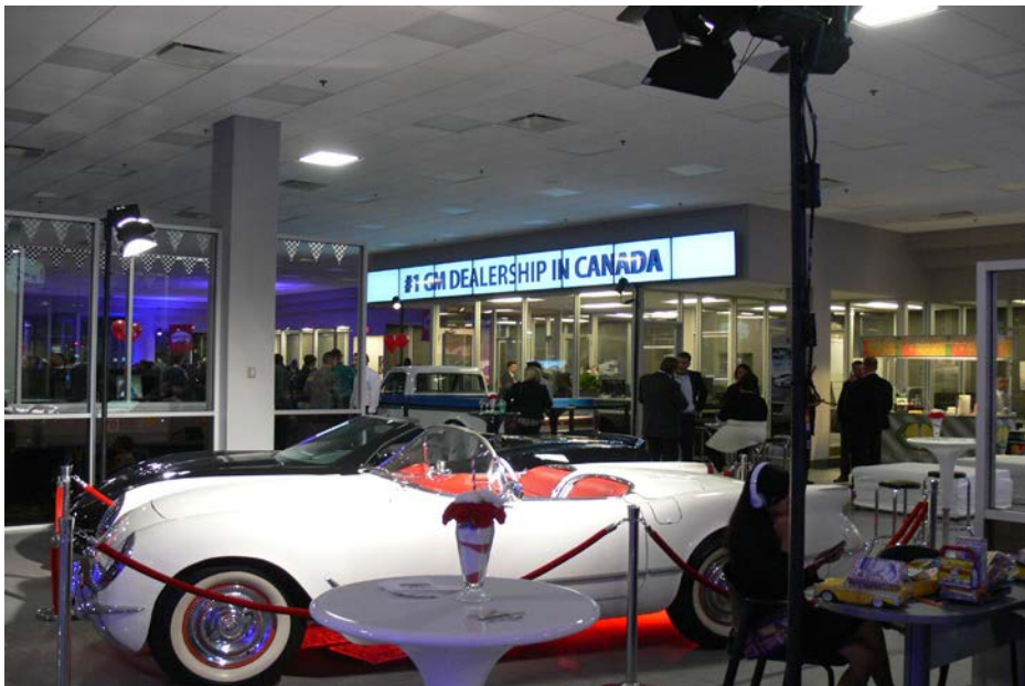
CMP GM Dealership in Calgary, Canada