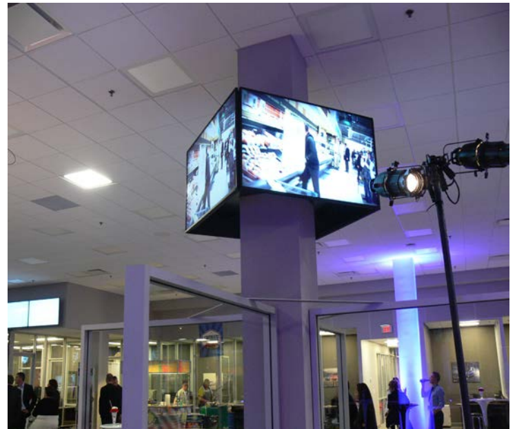
CMP GM Dealership in Calgary, Canada

This complete digital signage solution has put Kaizen’s dealerships at the forefront of customer messaging and customer experience in southern Alberta — it provides an excellent communication platform that’s easy to use, can grow as the dealerships grow and doesn’t break the bank.